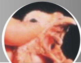
Oral & dermal lesions

Mycotoxin problem is always complicated with chemical & other toxins