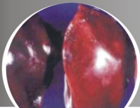
Pale liver syndrome